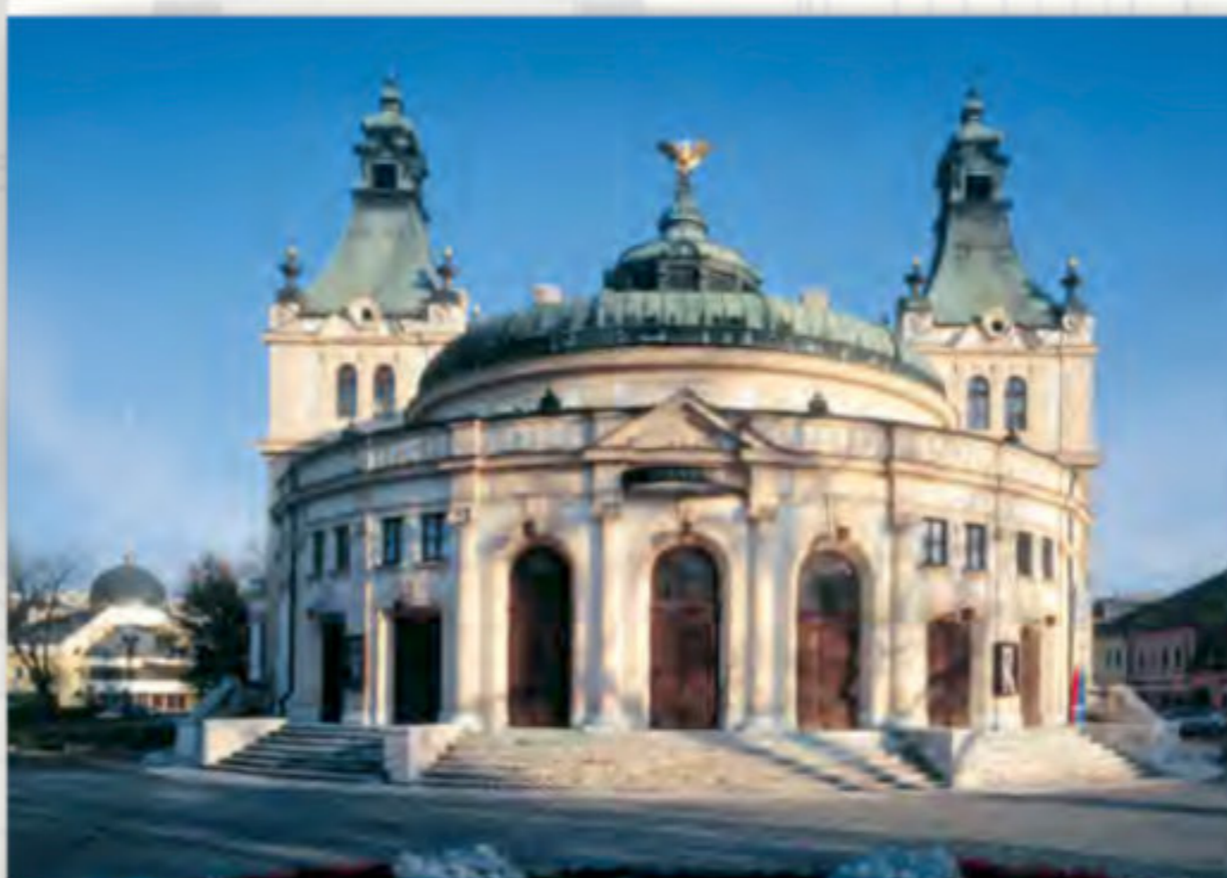
Exterior of the Spiš Theatre in Spišská Nová Ves