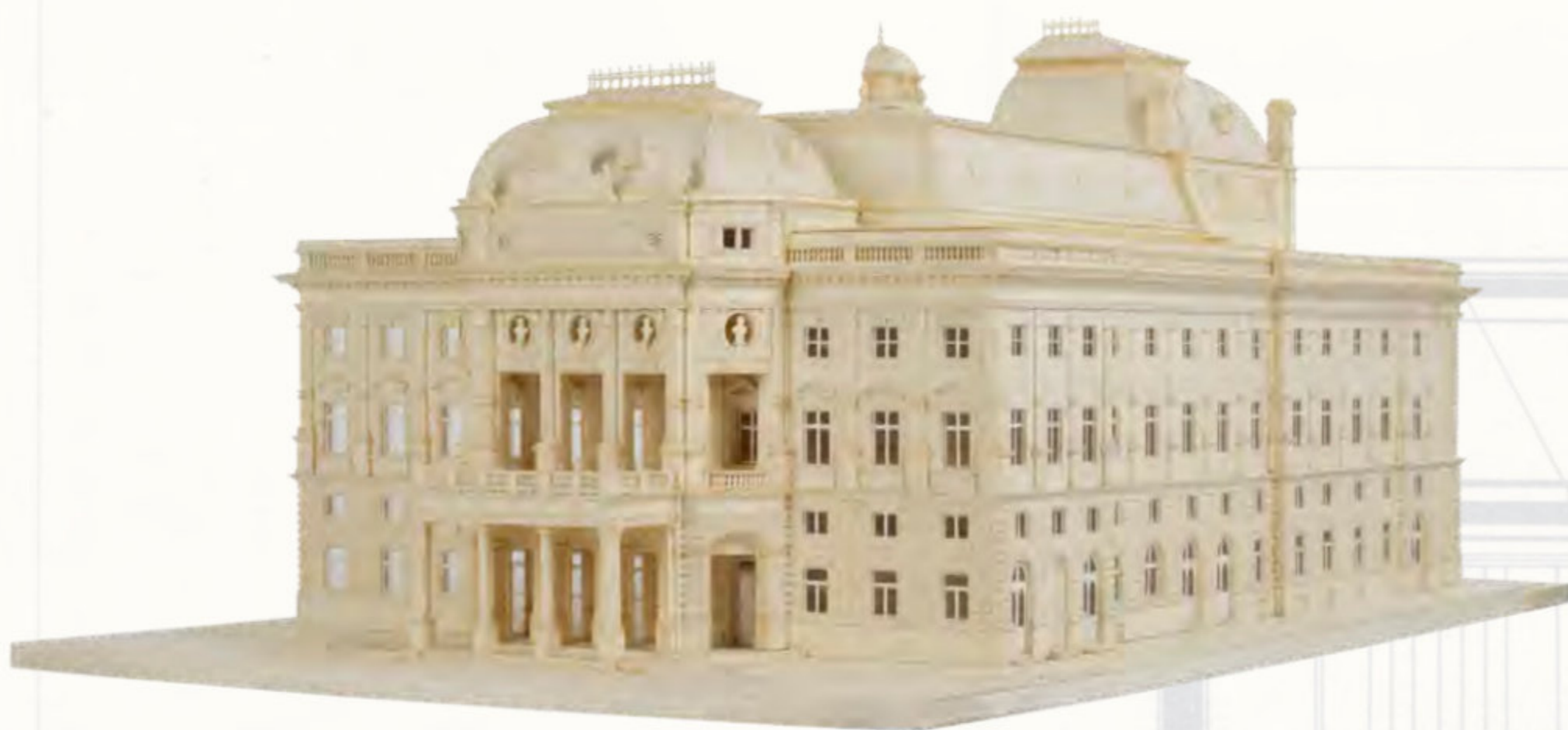
The Slovak National Theatre, historical building 1886 Architects Ferdinand Fellner, Hermann Helmer Scale model Ján Čisárik, Ladislav Čisárik

The building of the Andrej Bagar Theatre in Nitra is one of the modern standalone theatre venues. The building reflects contemporary ideas about flexible and complex theatre spaces. An example of modern architecture is the new building of the Slovak National Theatre in Bratislava. Three authors created a spatial concept by blending the classical order with abstract modernism. The overall space is divided into an opera stage, dramatic stage and experimental studio with flexible configurations of the stage and auditorium.