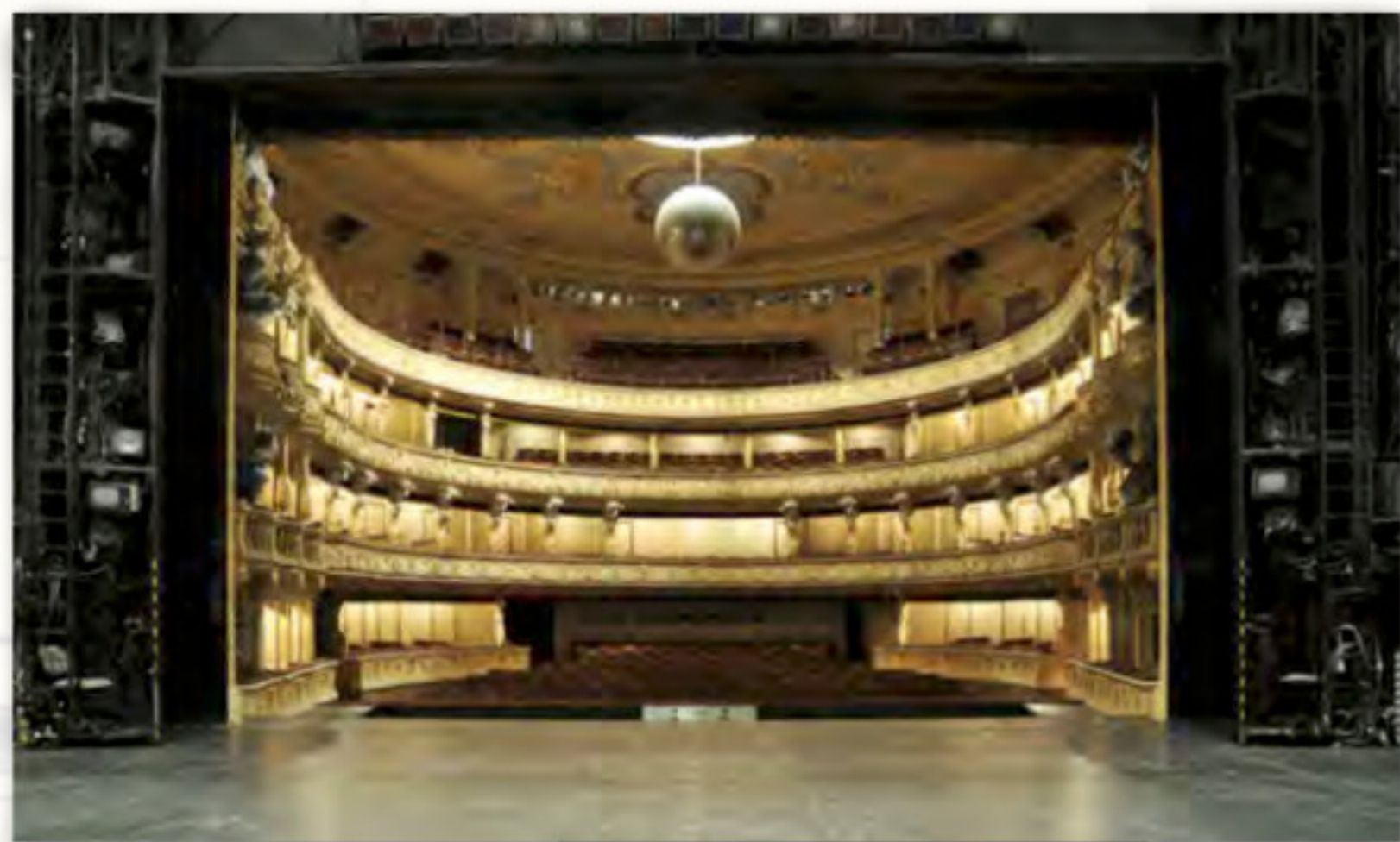
Interior of the historical building of the Slovak National Theatre