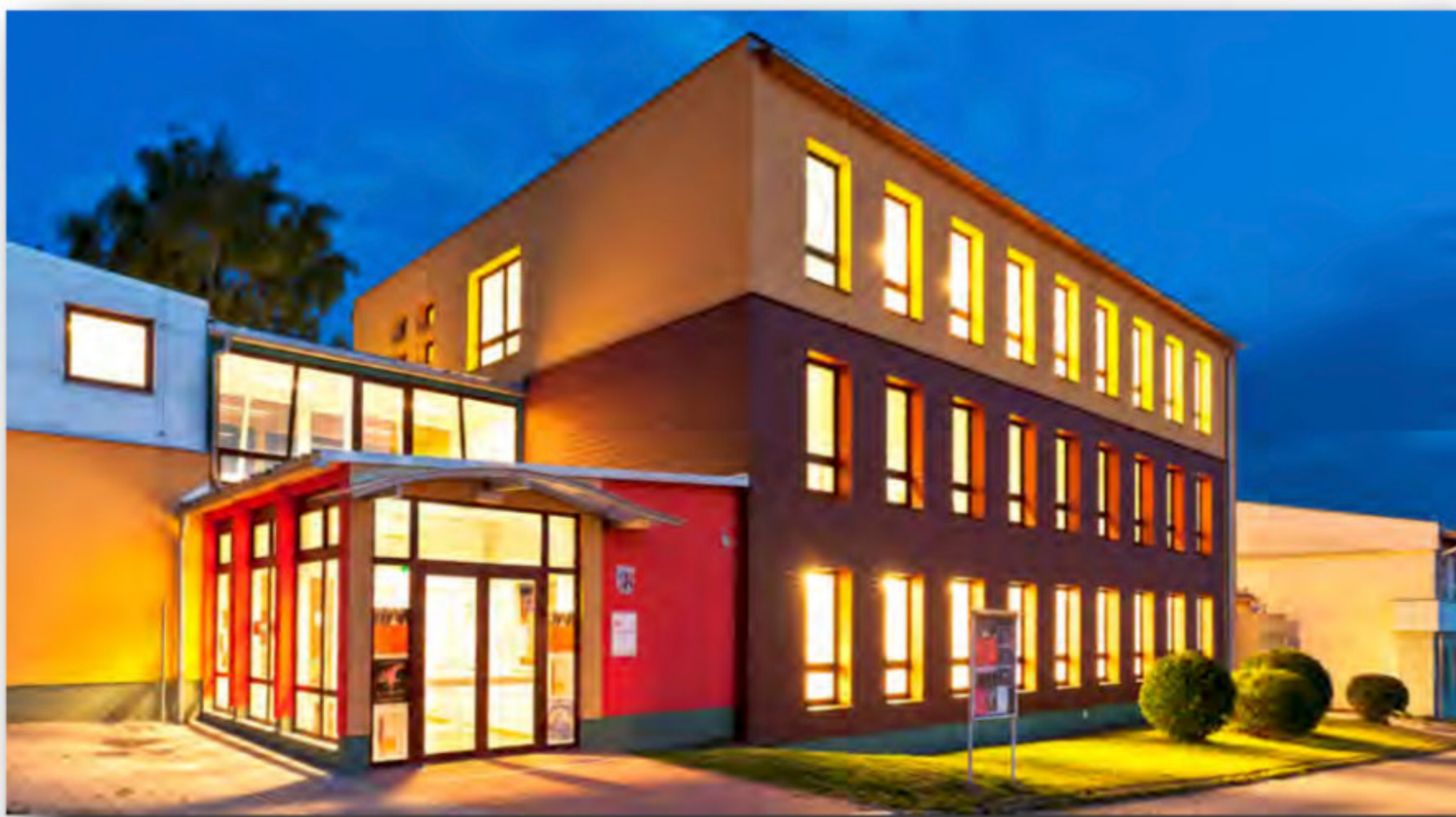
Dance Studio Theatre exterior

The architectural experiment Žilina-Záriečie Station – S2 was created as a multifunctional space in 2009. It was built from beer crates and it included a 12-meter long old shipping container. Unfortunately, this venue festooned with many awards burned down in 2019. In 2008, the spaces used by the Teatro Tatro theatre, a tent and a trailer, were supplemented with a new dramatic vehicle and a successful project The Magical Theatrical Vending Machine. It had a world premiere at the Cultural Olympics in Canada in 2010.