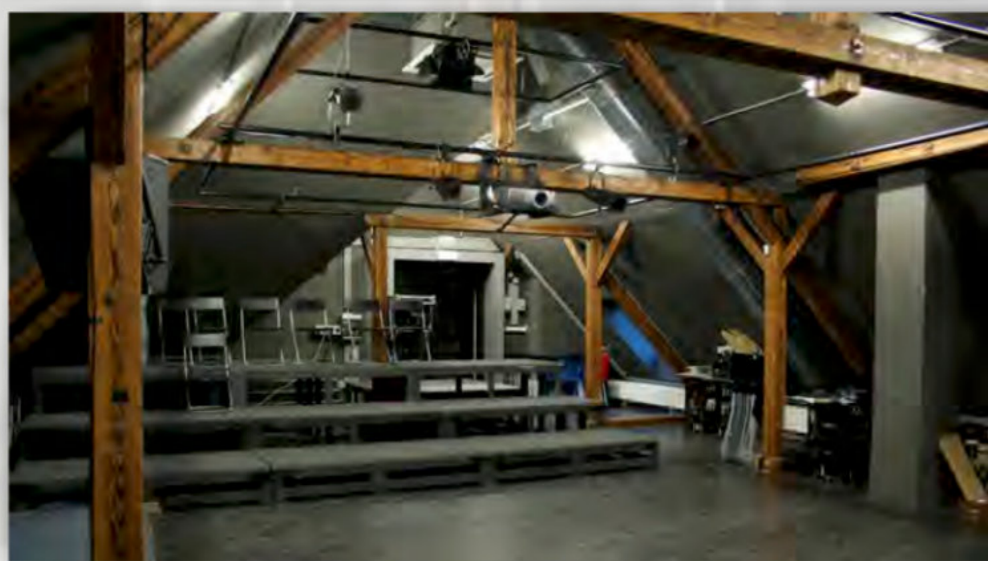
Žilina-Záriečie Station Theatre interior