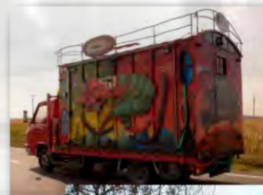
Teatro Tatro Theatre (The Magical Theatrical Vending Machine) Photo Theatre Institute Museum