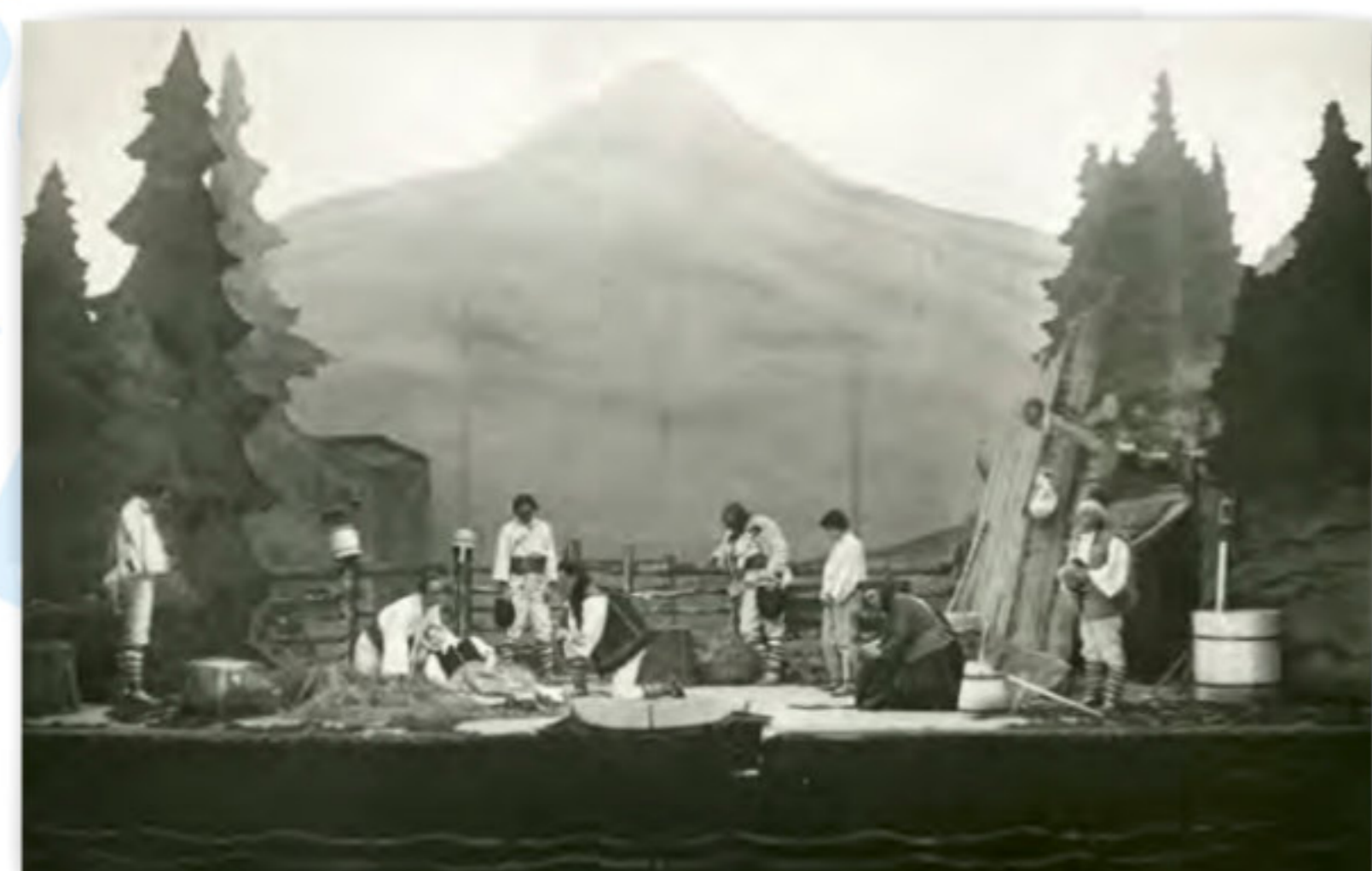
Ivan Stodola: THE SHEPHERD'S WIFE Slovak National Theatre Bratislava 4 October 1928 Directed by Janko Borodáč Wide-screen shot